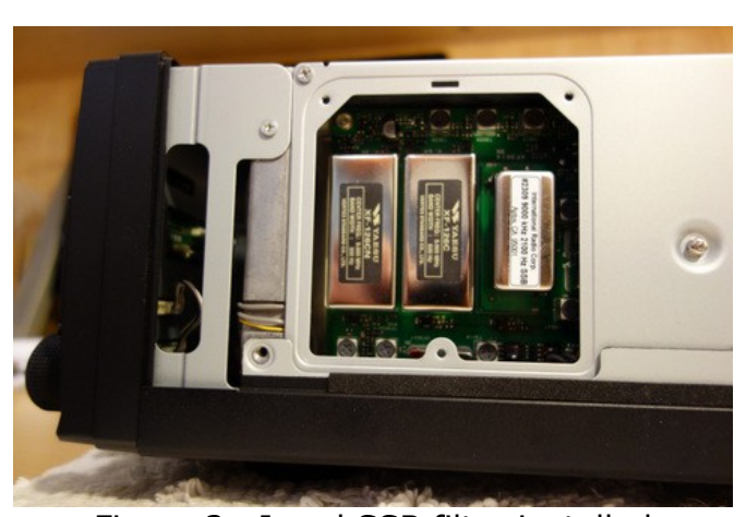
Figure 2. Inrad SSB filter installed