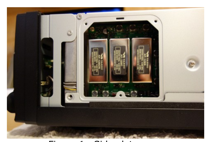
Figure 1. Side plate open